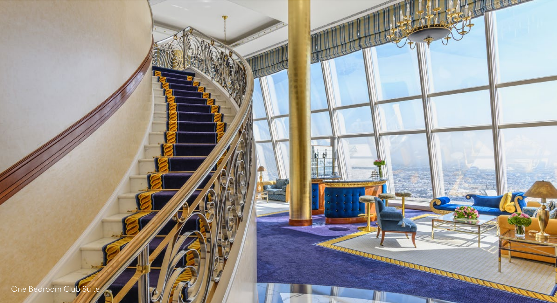
One Bedroom Club Suite