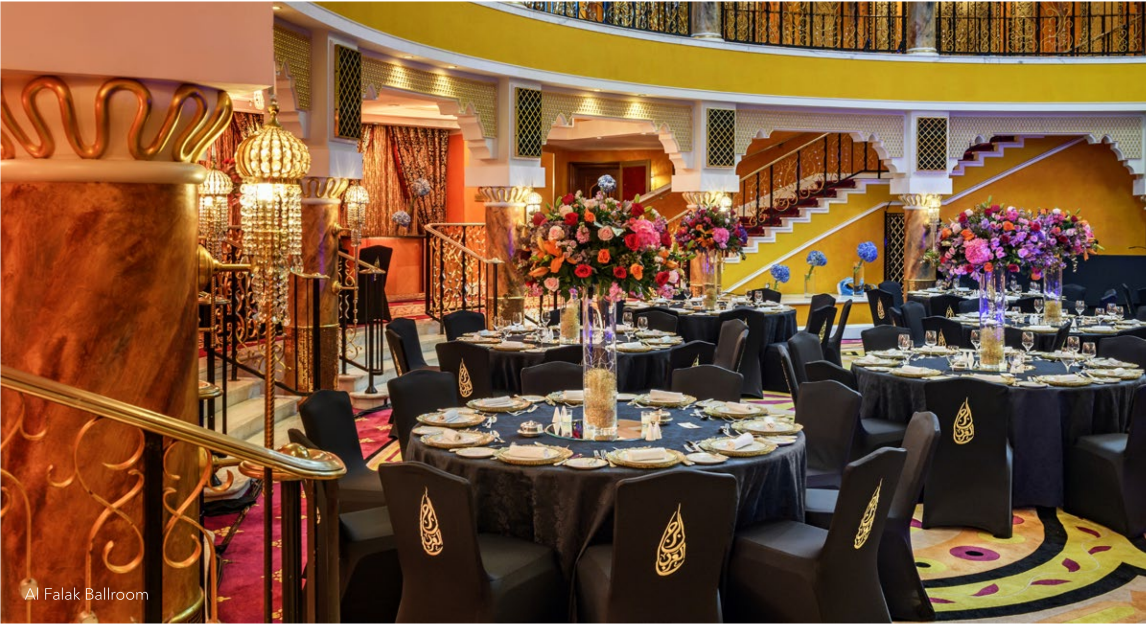
Al Falak Ballroom